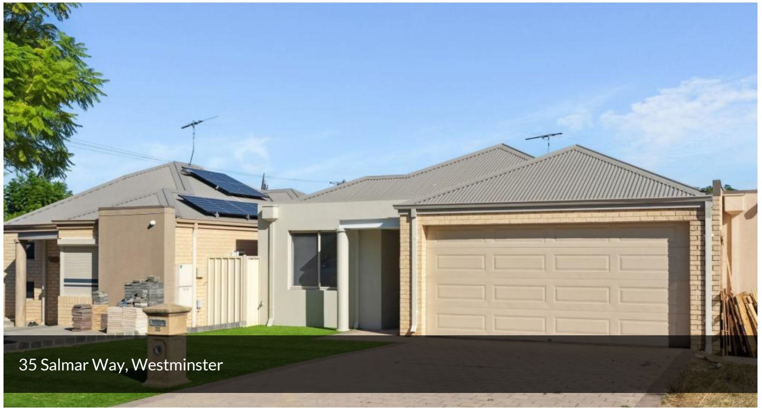
35 Salmar Way, Westminster